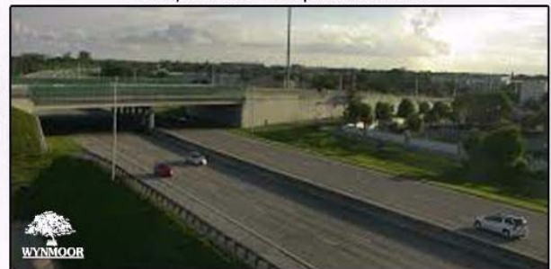
Tuesday Dinner Bus has been cancelled for this day.

Presentation by the Florida Department of Transportation Turnpike Division.